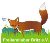
Freilandlabor Britz e.V.