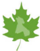
Koordinierungsstelle Umweltbildung Neukölln